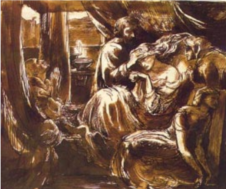
Dante Gabriel Rossetti. Study for the Death of Lady Macbeth.

LENNOX: And that well might Advise him to a caution, to hold what distance His wisdom can provide. Some holy angel Fly to the court of England and unfold His message ere he come, that a swift blessing May soon return to this our suffering country Under a hand accursed!