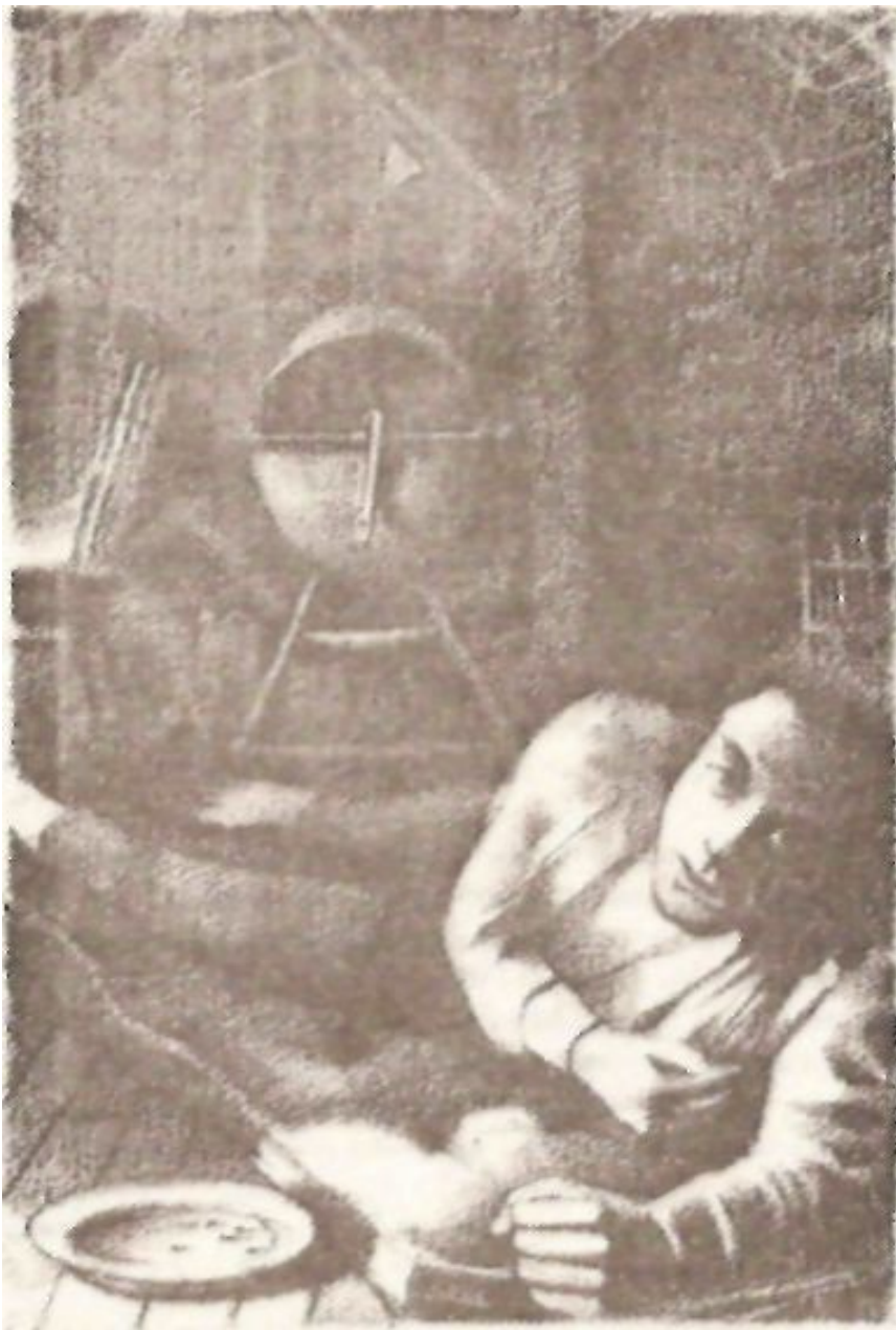
Suddenly an idea burst into his mind like a bright light. He looked at the idea from all directions and it still seemed sweet.

barbecue stove with all its tools and equipment, and remembered burning Fast Cars . . . and suddenly an idea burst into his mind like a bright light. He looked at the idea from all directions and it still seemed sweet. At last he had a plan which might be successful. He fell asleep again with a smile on his face, dreaming about the next pages he would write.