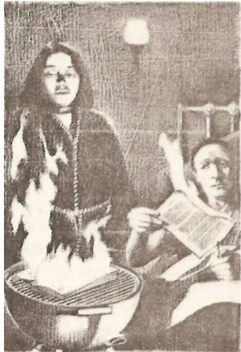
So he burned his book - a few pages, enough to please her, to show her that he was good.

He heard the sound of a key in the lock. She came and fed him some soup.