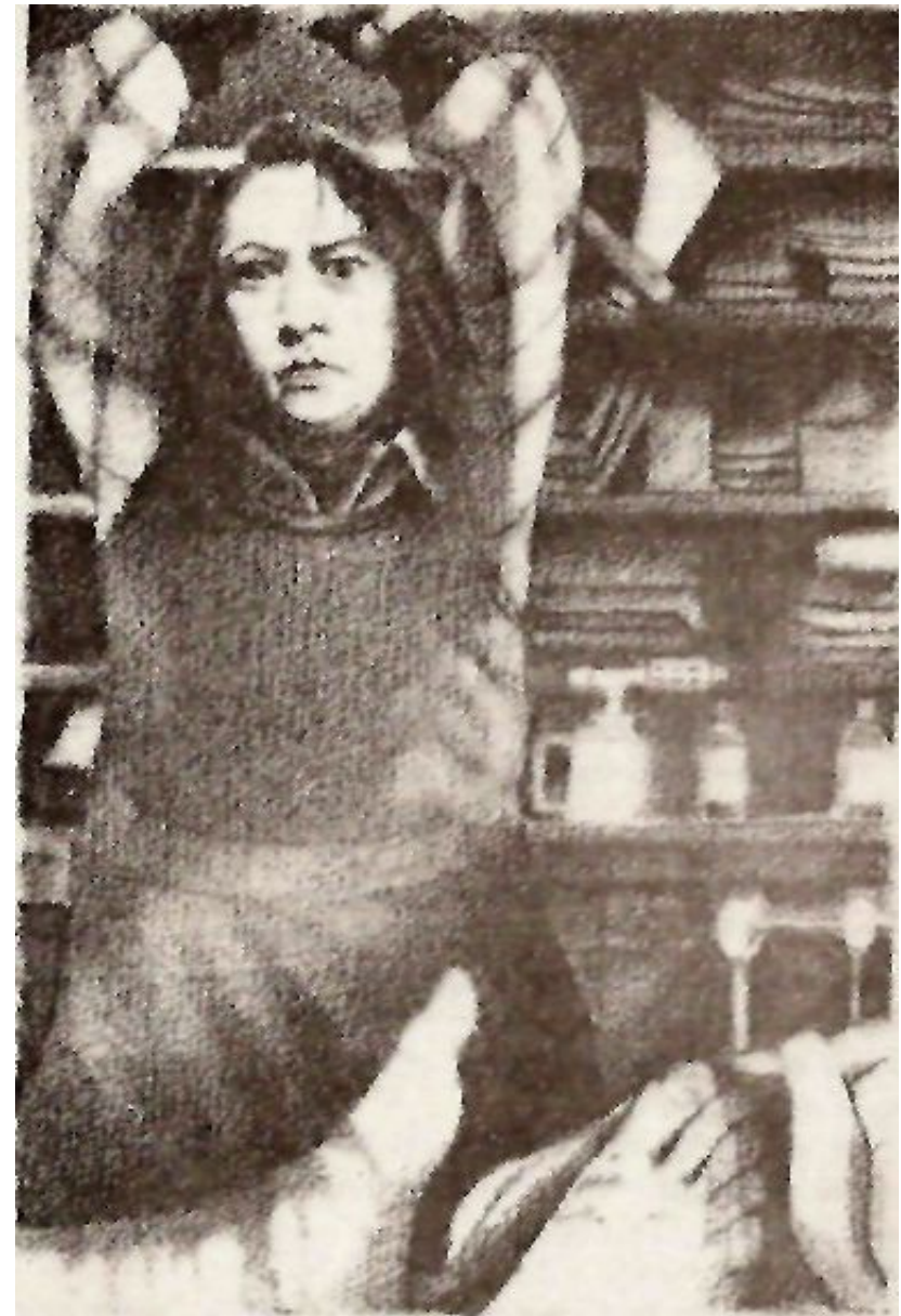
She seized the axe in both hands and moved her feet so that she was standing firmly on the floor.

Annie pulled the axe out of the mattress and threw it on to the ground. She picked up the blowlamp and lit it with a match.