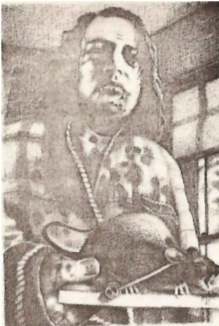
In her other hand was a rat-trap. There was a large grey rat in it. The trap had broken the rat's back.

her other hand was a rat-trap. There was a large grey rat in it. The trap had broken the rat's back. There was blood around its mouth, but it was still alive. It was struggling and squeaking .