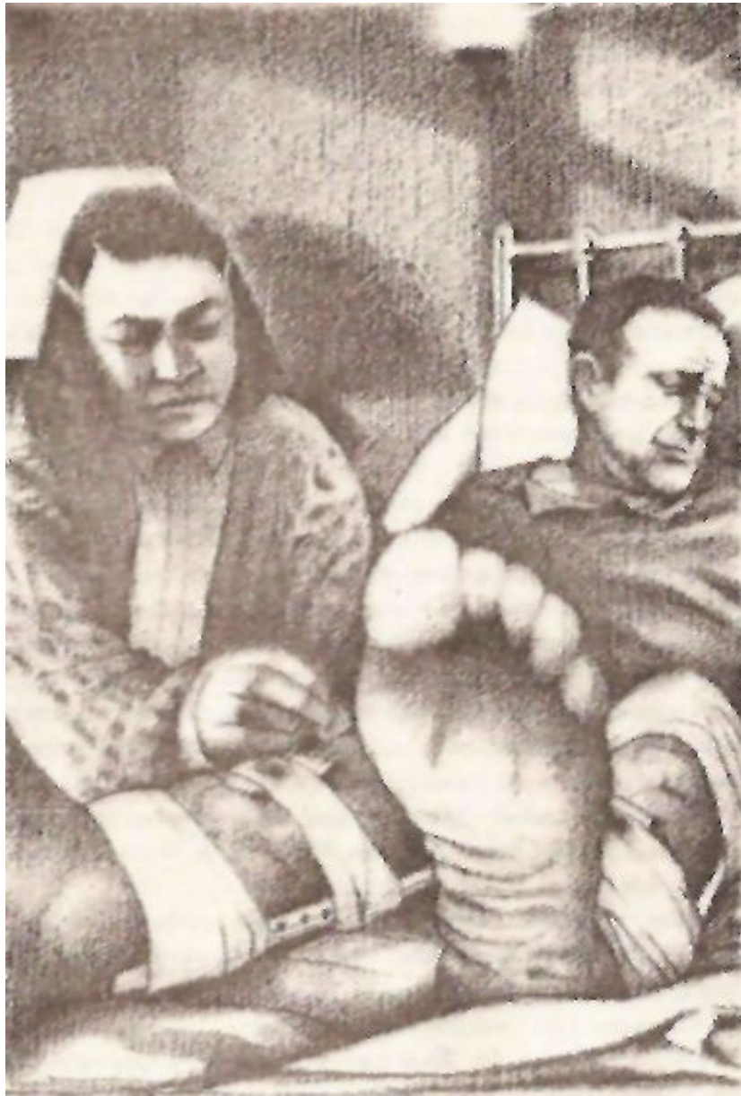
She had tied splints firmly and cleanly on to both legs.

the room, she turned back towards him and said: 'You owe me your life, Paul. I hope you remember that. I hope you'll keep it in mind.'